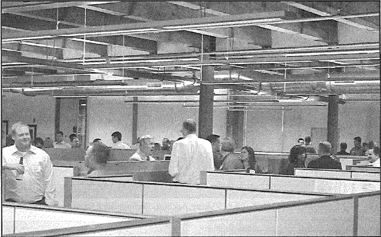
Office space turned party space for attendees at the open house

C leary Zimmermann Engineers celebrated their fifth anniversary by hosting an open house at their newly renovated office space Apr. 21. The company is housed in a historic early-1930's warehouse in the 'SoFlo' area of downtown San Antonio, located at 1344 S. Flores Street. Over 200 guests attended the event, which included a self-guided tour of the newly remodeled first floor office space, as well as the untouched 2nd floor. The contrast of the old 2nd floor compared to the new 1st floor provided a nice glimpse into the building's past use. —dn